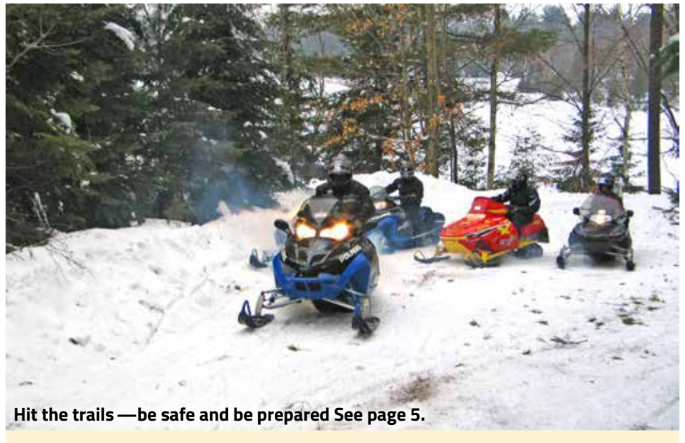
Hit the trails —be safe and be prepared See page 5.

out electronically, our website and Facebook page were updated regularly, and e-mail blasts were sent out with monthly updates to our membership from April through to September.