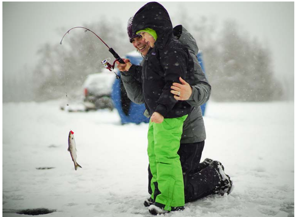
See Lake Steward - Page 7

We opted (again) this year not to hold our popular association social activities – the poker run and