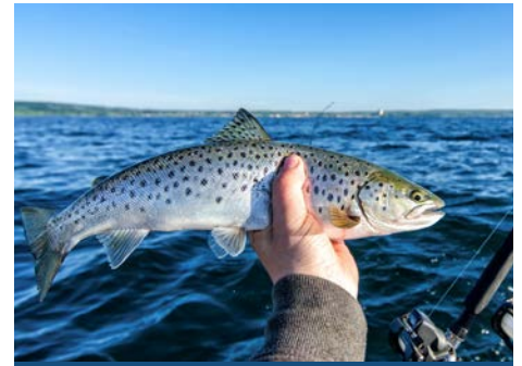
SYLVIA HILLIER, CHAIR, FISH COMMITTEE

Unfortunately, we are no longer able to process payments by credit card. Please stay tuned as we investigate other options for accepting credit cards.